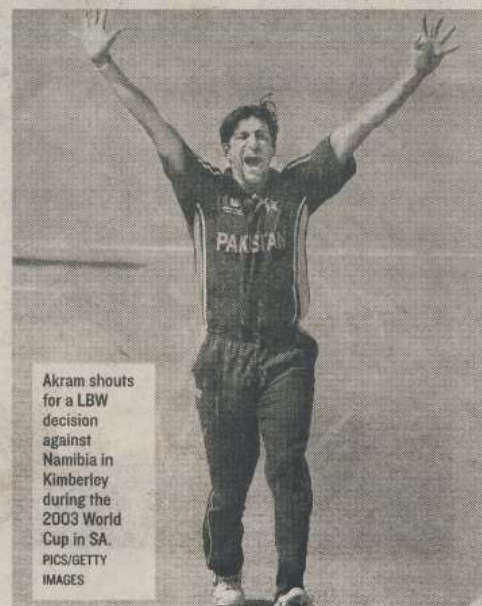
Akram shouts for a LBW decision against Namibia in Kimberley during the 2003 World Cup in SA.

Wasim Akram, who made appealing a fine art during his playing days to win marginal decisions, now wants to teach young Indian fast bowlers how to appeal convincingly. Akram has been roped in by the Gatorade Centre for Pace Excellence (GCPE) as chief bowling coach in New Delhi. "I will teach them how to appeal. That is also an art that keeps the umpires under pressure in a legal way," Akram said yesterday.