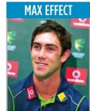
Australian all-rounder Glenn Maxwell went from golden duck — he was clean bowled by Darren Sammy off the first ball he faced in the ODI against West Indies at Perth on Sunday — to golden goose in just over an hour at the IPL auction in Chennai

expected, had no takers. Interestingly their names were brought back to the bag during the afternoon session upon some teams' request. They, however, went unsold.